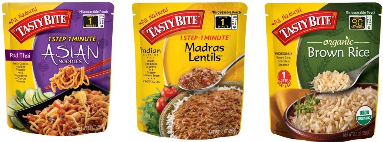
Examples of Tasty Bite® Brand Products